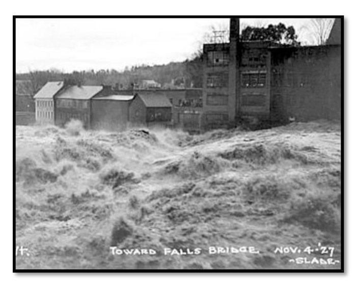
Downtown Springfield VT, 1927