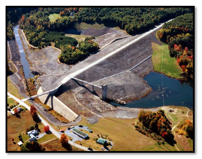
North Springfield Flood Control Dam, n.d.

If weather patterns continue to trend towards increasingly stormy weather, it is likely that more are yet to come. The park itself is not prone to flooding, being on steep terrain, any excess runoff does just that, it runs off. On the ridgeline, small pools of rainwater tend to form, but these are self-limiting in that they have a maximum depth and any excess water will simply overflow and run down the hillside.